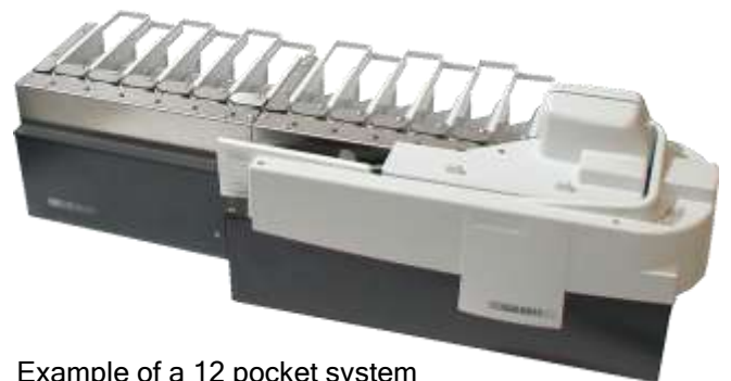
Example of a 12 pocket system (SCN6011 + 1 BS6011 module)